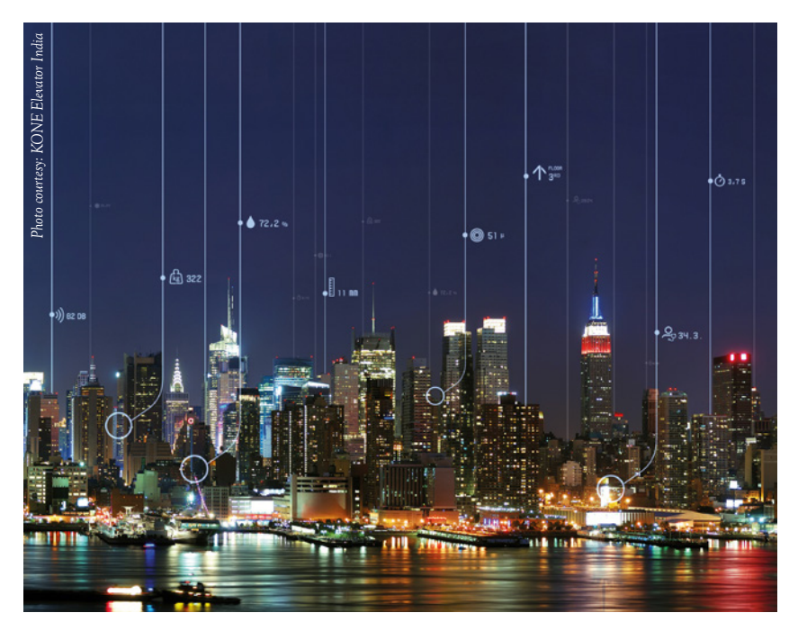
Mid-rise and high-rise residential and commercial buildings are the biggest demand drivers for elevators.