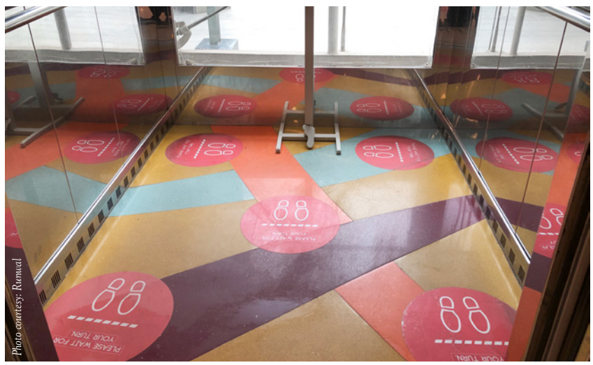
Safety measures include incorporation of place markers and regular cleaning and disinfection of elevator buttons, doors and walls.