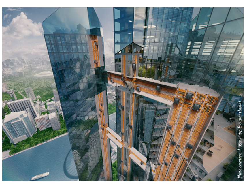
Companies are developing fast and energy-efficient elevator systems equipped with intelligent traffic control to ensure social distancing.